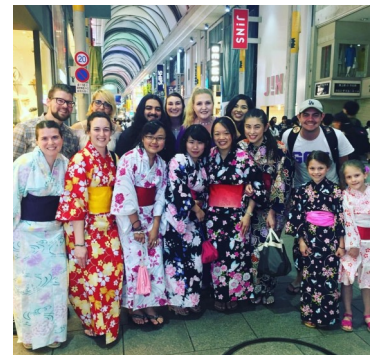
"ABC gang takes Toukasan ": a group from my church went to a matsuri together to eat Japanese street food, summer 2017

https://www.nippon.com/en/features/h00226/believe-it-or-not!-