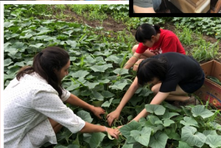
Since I came home, my family has been able to host several of the young people I befriended in Hiroshima.