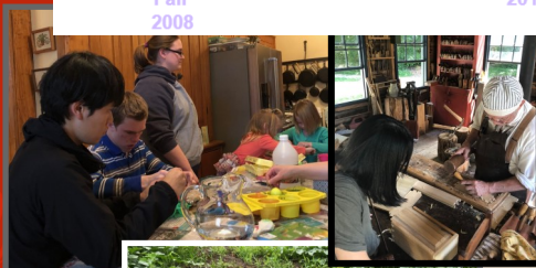
Asaminami Bilingual Chapel, Hiroshima, Japan, including students visiting from Grand Canyon University, spring 2017